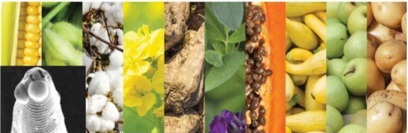
Head of plant-parasitic nematode covered with bacterial spores

£10 for non-members, includes tea/coffee & biscuits